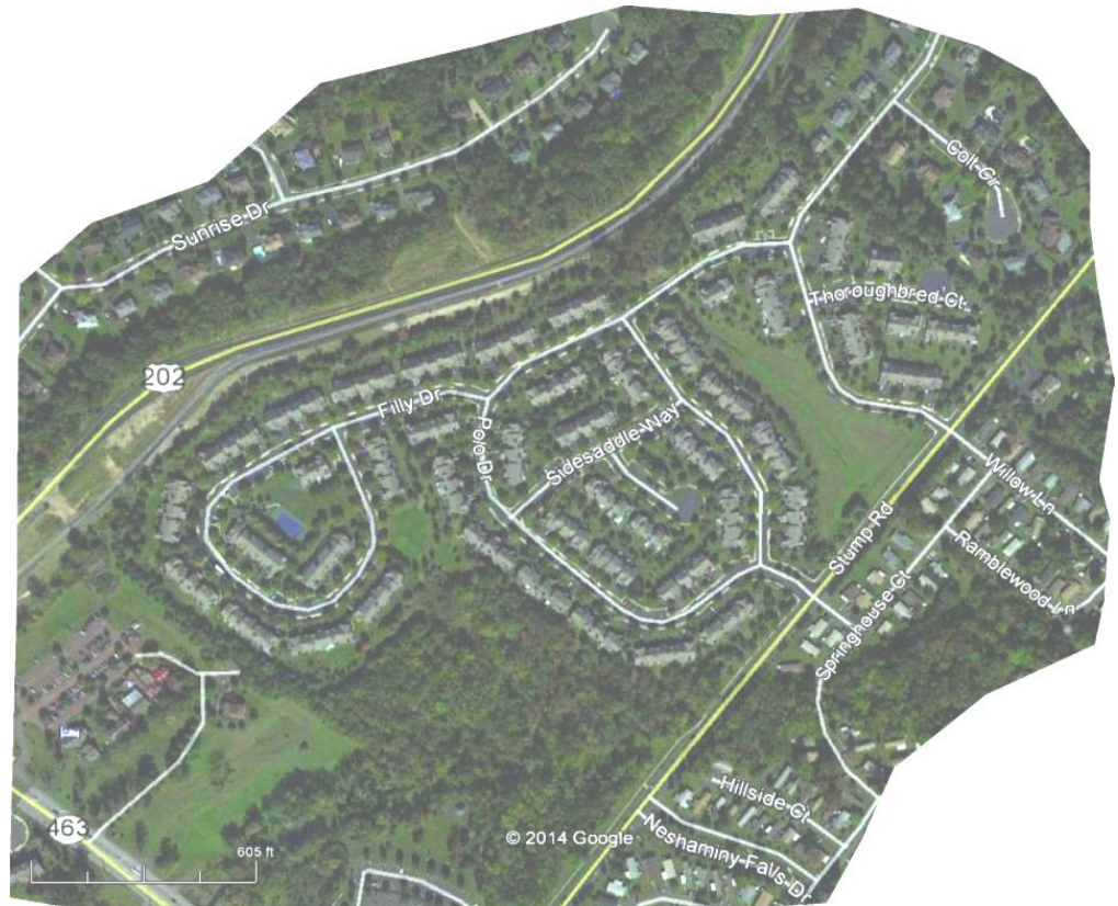
Aerial View of Community ±1.4 Miles of Roadway

Over the course of two (2) construction seasons, the entire roadway pavement was stripped down to its base and rebuilt with new paving. This method of reconstruction essentially gave the community new roads with a very improved surface life compared to most surface treatments.